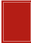
Full page 280 D x 225 W (page trim)