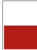
Half page 120 D x 183 W (no bleed)